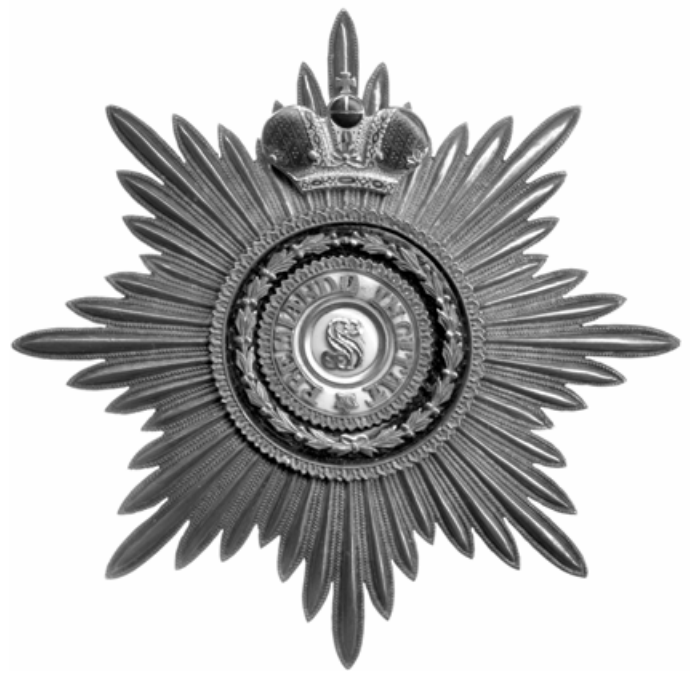
248 Order of St. Stanislaus , 1 st class breast star, by Keibel of St. Petersburg, in silver, fitted with a good quality gilt and enamel centre by another maker, gilt reverse, 87.5 mm., fitted with a later, unofficial Imperial crown, extremely fine £700-1,000